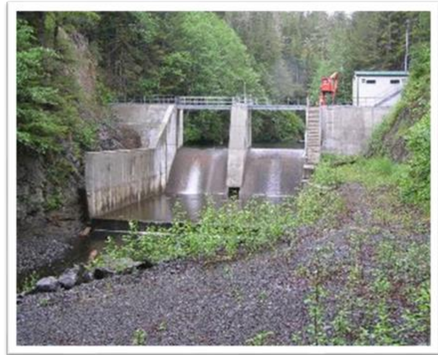
Water supply dam, Kake, Alaska