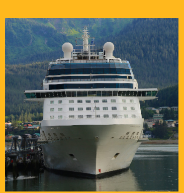
CRUISING FOR ALASKA'S WORKFORCE ACT