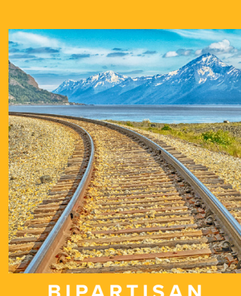
BIPARTISAN INFRASTRUCTURE INVESTMENT AND JOBS ACT